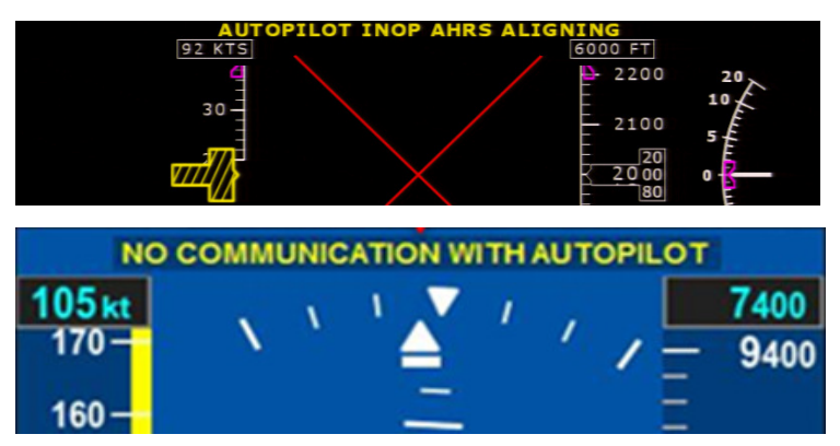
PFD Autopilot Annunciator (Avidyne top image, Aspen bottom image)

Autopilot failures that prevent any operation are annunciated across the center of the PFD mode annunciator strip in amber (yellow) as shown in the examples immediately below.